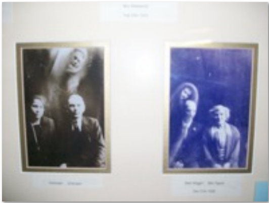
PHOTO OF ACTUAL SPIRIT PHOTOGRAPHS IN MUSEUM AT ARTHUR FINDLAY COLLEGE, STANSTED UK